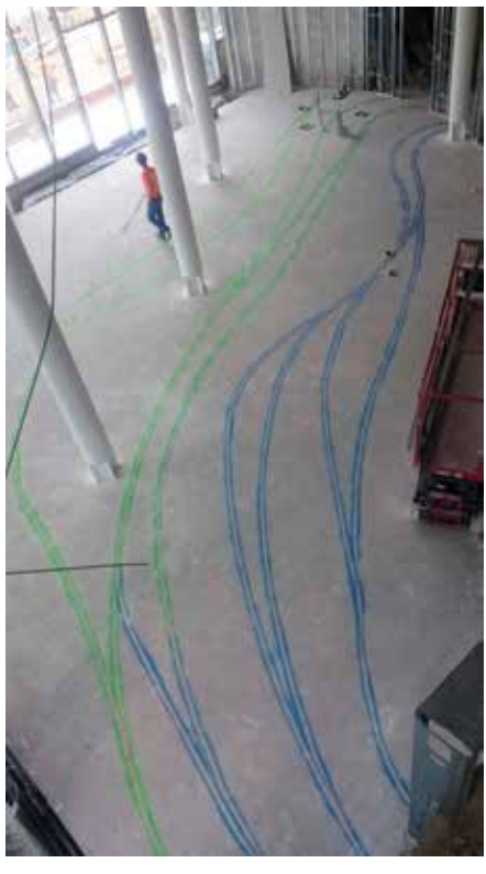
Layout complex shapes quickly and accurately