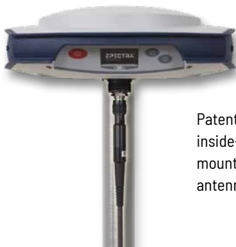
Patented inside-the-rod mounted UHF antenna design

With the most advanced and rugged field data collectors from Spectra Geospatial, surveyors get maximum productivity and reliability every day. Spectra Geospatial Survey Pro software is specifically tailored for the SP85 GNSS receiver providing easy-to-use, yet powerful GNSS workflows, letting the surveyor concentrate on getting the job done. Spectra Geospatial Survey Office Software provides a complete office suite for post-processing GNSS data and adjusting survey data, as well as exporting the processed results directly back to the field or to engineering design software packages. Combined with Spectra Geospatial field and office software, SP85 is an extremely powerful and complete solution.